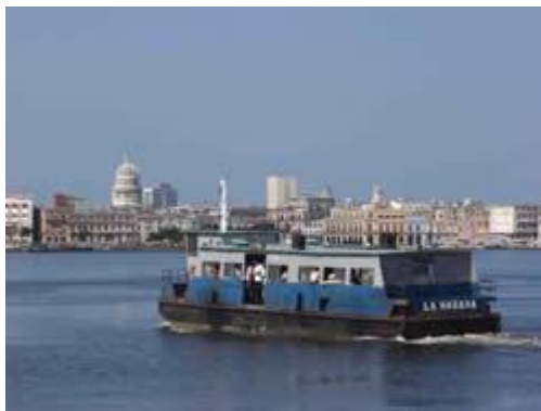
The launch across Havana Bay to Regla

Ediciones Vigía produces lovely limited-run hand-made books.